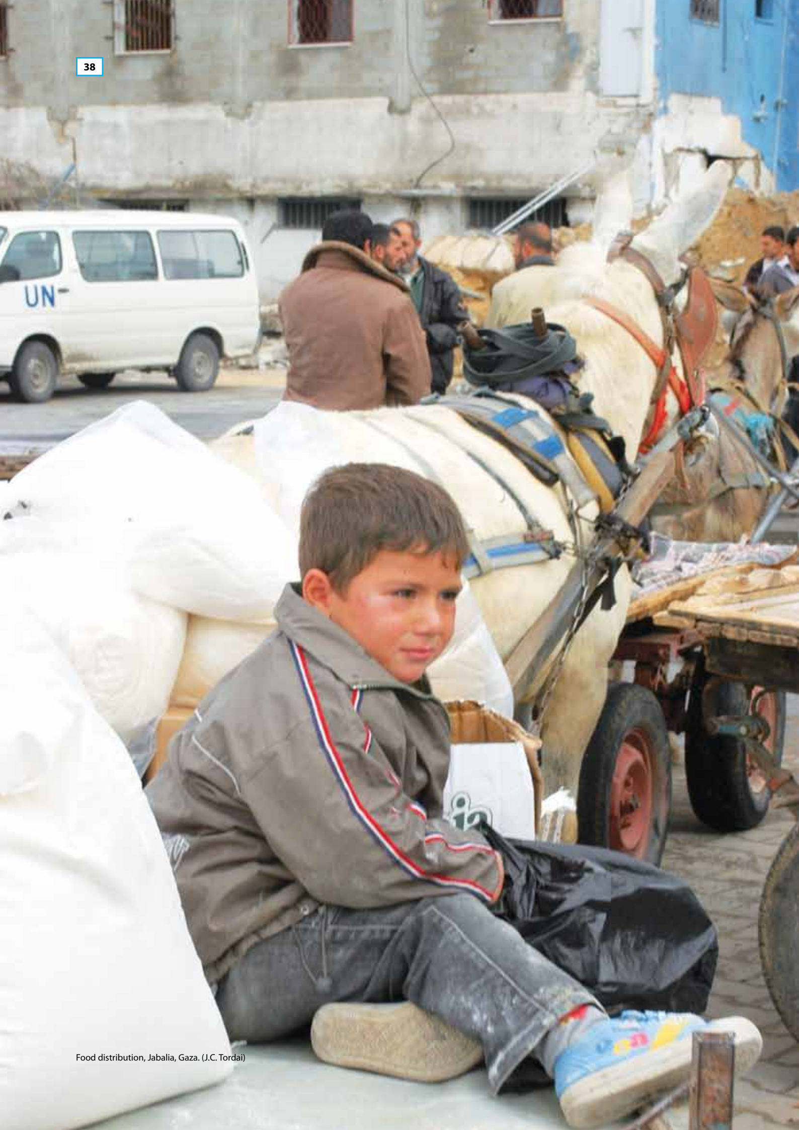
Food distribution, Jabalia, Gaza. (J.C. Tordai)