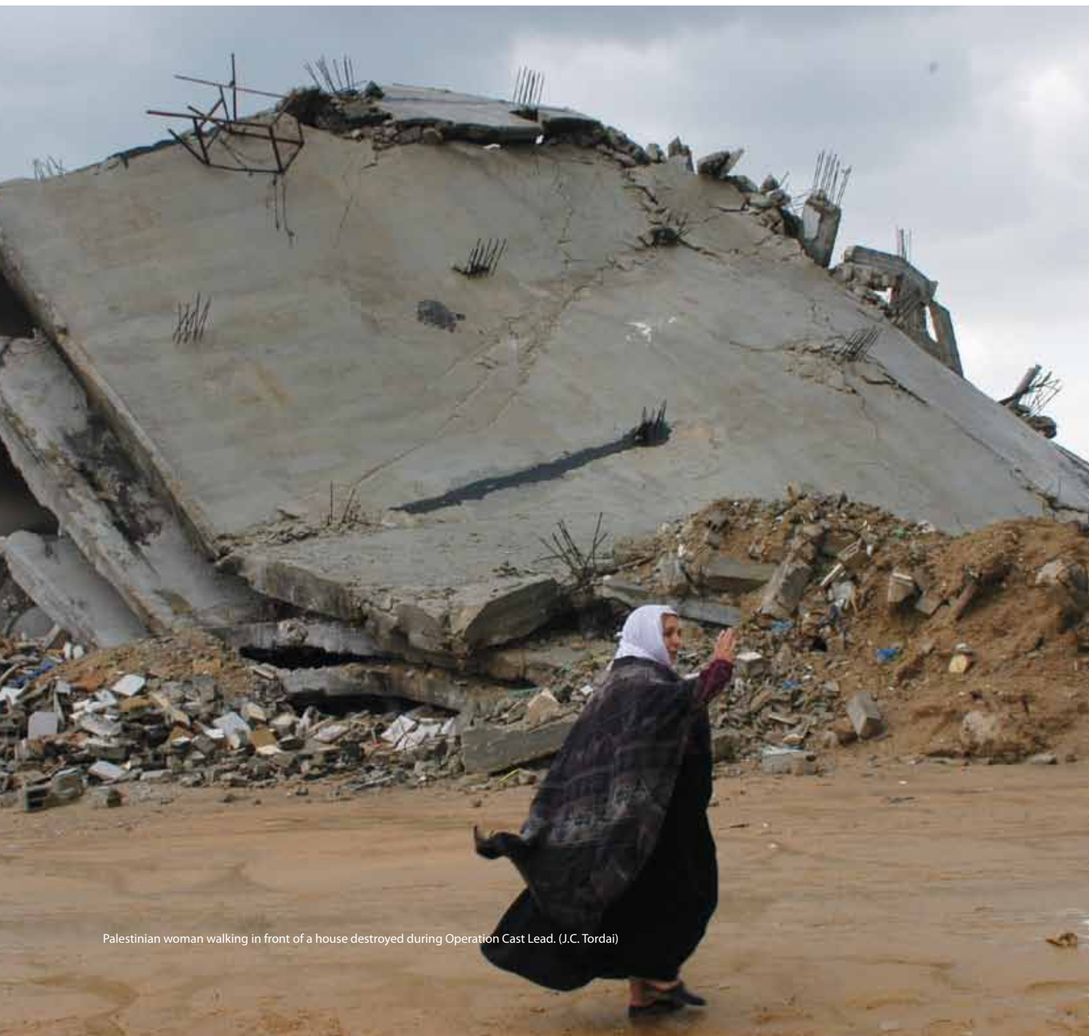
Palestinian woman walking in front of a house destroyed during Operation Cast Lead.