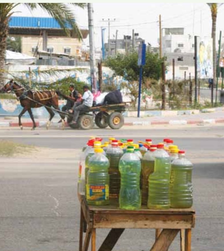
Egyptian petrol smuggled in through the Rafah tunnels for sale at a road side stand in Gaza.

The protracted socio-economic crisis is a direct result of the access and movement restrictions imposed on Palestinians and Palestinian goods by the Government of Israel (GoI). The physical barriers to movement in the West Bank and Gaza are the most visible manifestation of a complex and multi-layered military occupation regime which continues to weigh heavily on all aspects of Palestinian life in the oPt.