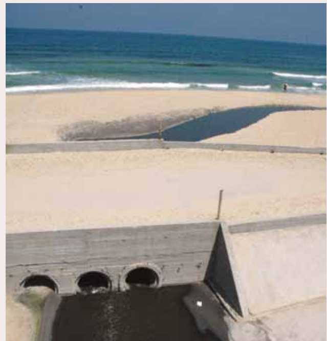
Sewage flowing into the Mediterranean in Gaza

The health care system in Gaza is coming under increasing strain, due to chronic shortages of consumables, fuel and electricity, the inability of medical staff to develop skills and knowledge, and the lack of spare parts and equipment needed for the maintenance and upgrading of facilities 18 , including those damaged during Cast Lead. Access to specialist medical services only available outside Gaza continues to be constrained, whilst other determinants of health, such as food security, socio-economic conditions and water / sanitation, have also been seriously affected by the protracted blockade and Cast Lead operation. This has translated into reduced quality of care, piling additional pressure on other service providers, including UNRWA.