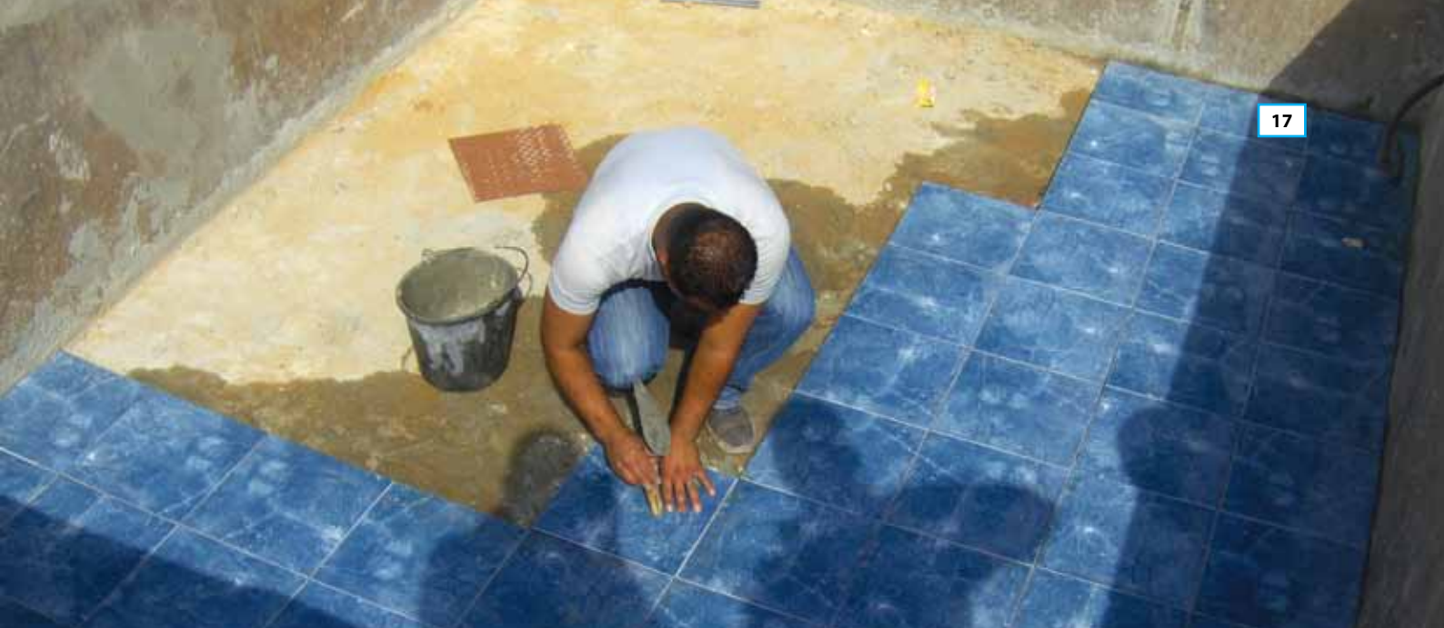
JCP worker laying tiles in the West Bank.

involve basic construction, rehabilitation, supervision and cleaning, whilst skilled work includes plumbing, electrical work, tiling and stonemasonry for men, and carpet-weaving, teaching and library assistance for women. Under the skilled component of the programme, special attention will be given to the selection of graduates and females meeting the socio-economic eligibility criteria, to support their skills and capacity development. Labourers and materials / tools procured under this programme will be used to support shelter rehabilitation and environmental health activities outlined elsewhere in this appeal.