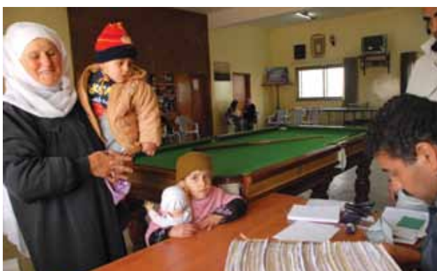
UNRWA Mobile Health Clinic in Beita, West Bank. (Isabel de la Cruz)

To mitigate the impact of closure and impoverishment on the health status of Palestinians living in isolated or remote areas of the West Bank, UNRWA will continue to provide mobile health services through five mobile clinics. These will service 81 locations which lack access to primary health care, including three fixed hubs in Nablus, Jerusalem and Hebron. The clinics will provide a range of services, such as preventive and curative primary health care, health awareness and advice, mental health counseling and blood testing. The frequency of visits will vary according to the needs of the community (e.g. population size, extent of isolation), with at least one visit per location each month 26 . For the fixed hubs, which have been chosen due to their proximity to population centres, the frequency of visits will be higher. To ensure that the programme remains responsive to needs, UNRWA will divert resources away from those areas where access problems have been temporarily eased towards locations where tight restrictions remain in force (e.g. Seam Zone areas).