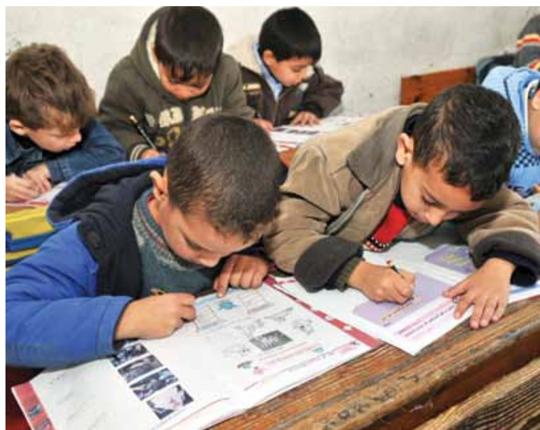
Boys in an UNRWA school in Gaza resume their studies following Operation Cast Lead with supplies provided by the Agency.

foster the development of a quality learning environment within schools. Particular attention will be given to the learning needs of boys in preparatory schools. The Agency will also continue to implement a dedicated human rights curriculum in its schools.