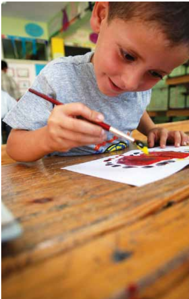
School boy in Gaza

and declining access to safe and adequate water and sanitation services for the population. Upto 80 million litres of untreated and partially treated sewage is pumped into the sea off Gaza each day, posing major environmental and health risks. Ten months on from the end of the war, around 10,000 persons in northern Gaza still lack access to running water due to a lack of materials for maintenance and repair, whilst the rest of the population only has intermittent supplies, resulting in overall consumption levels that fall far below acceptable international standards. 19