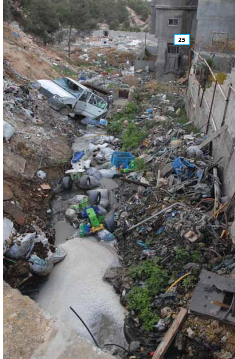
Waste-water disposal in Shu'fat Camp, East Jerusalem. (Isabel de la Cruz)

To improve environmental conditions and reduce the risk of communicable diseases, UNRWA will also remove solid waste from Shu'fat, Jalazone, Balata, Askar, Camp No.1, Tulkarem, Nur Shams and Jenin. In these camps, the closure regime prevents the Agency from accessing previously available landfills and cash strapped local authorities are unable to cover the increased costs of such services. As a result, official dumping sites are increasingly overloaded and access by UNRWA rendered increasingly difficult. As part of this intervention, UNRWA