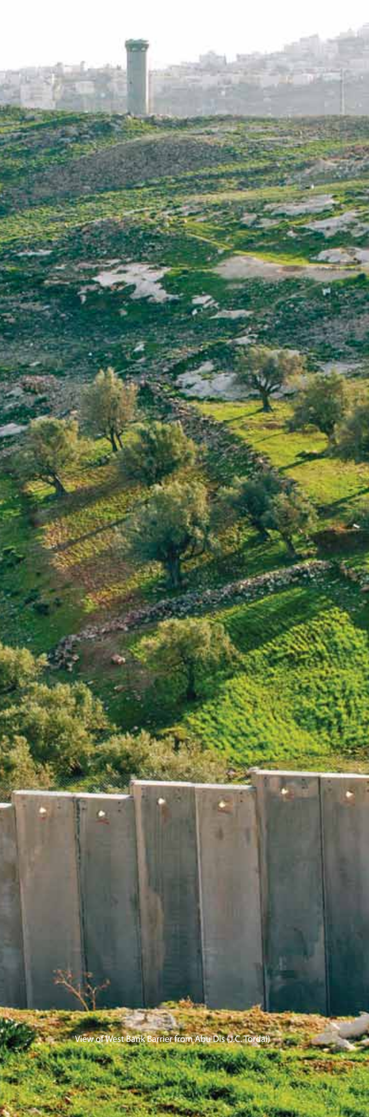
View of West Bank Barrier from Abu Dis