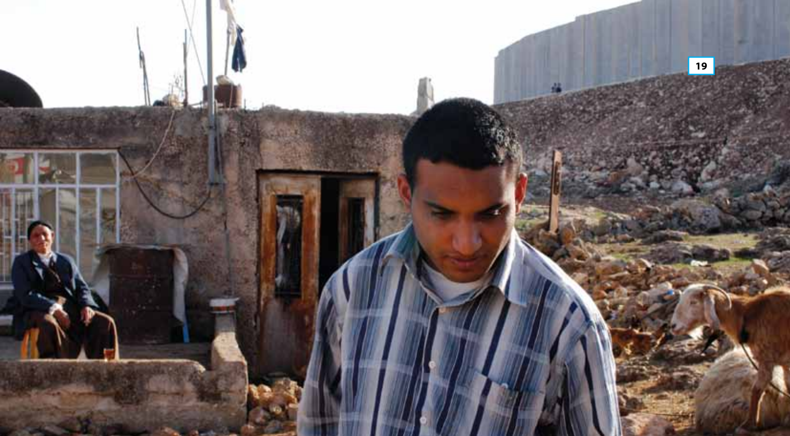
A blind refugee in Hizma, West Bank.