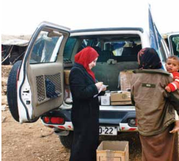
A mobile health team in Umm al Kher, West Bank.

Resources for capacity and coordination components of this appeal will ensure that UNRWA is able to meet the high demand for emergency programme services effectively in accordance with established criteria.