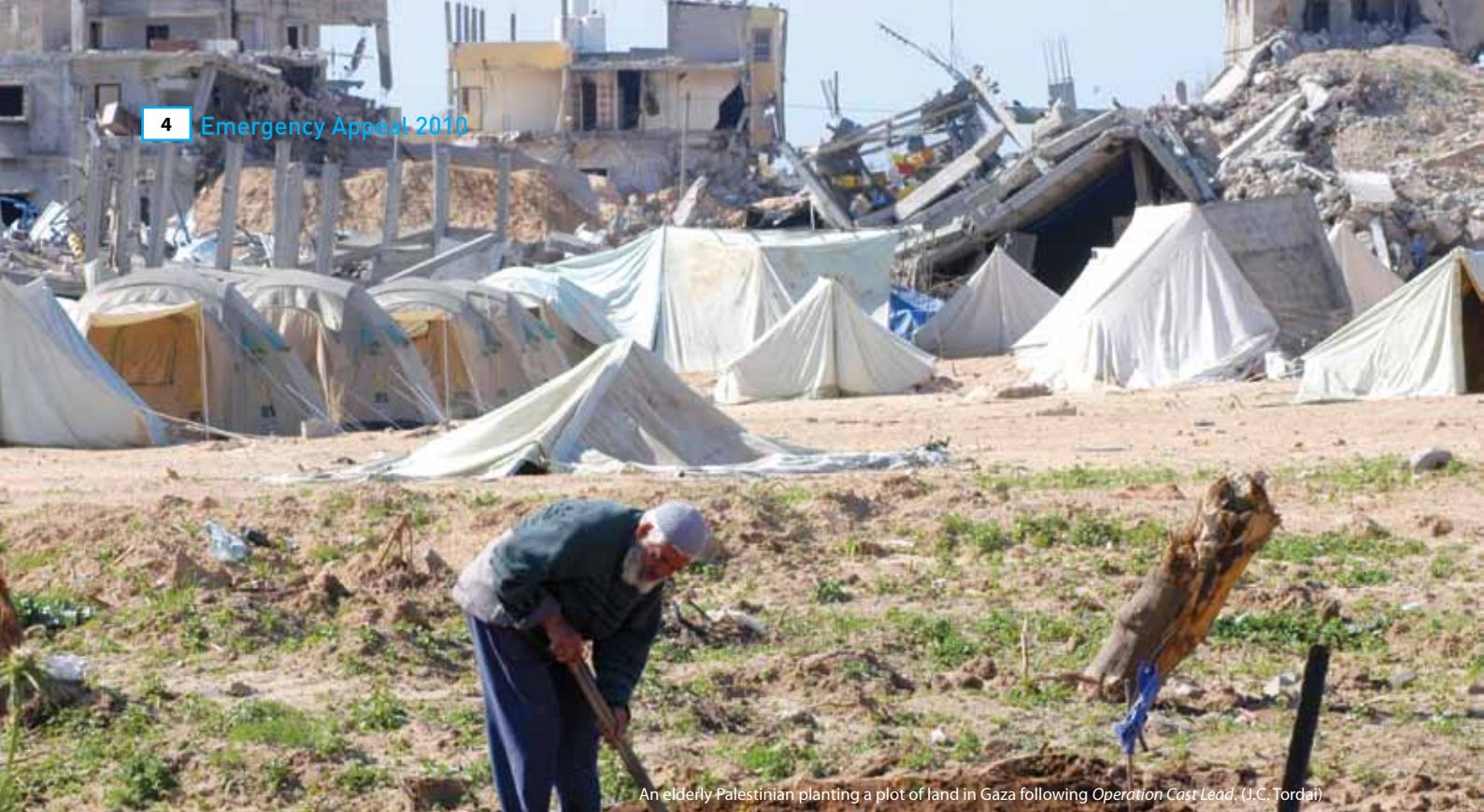
An elderly Palestinian planting a plot of land in Gaza following Operation Cast Lead.