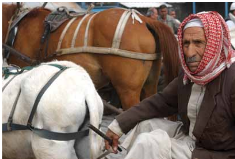
An elderly Palestinian in Gaza. (J.C. Tordai)

In Gaza, the period since the imposition of blockade has seen dramatic increases in unemployment. Core productive sectors, including agriculture, manufacturing and construction, have slumped, contributing to a sharp contraction of the private sector, of almost 25 percent during 2008. Job losses would have likely been even more precipitous were it not for expanded emergency job creation efforts by UNRWA and others, the growth in the tunnel economy and - in the immediate aftermath of Operation Cast Lead - large scale post-war clean up activities. In the longer term, the widespread destruction of public infrastructure during the war has significantly deepened the economic and labour market crises facing Gaza. Unemployment rates are far higher than when the economic and political siege was intensified in mid-2007 and will remain so until it is lifted.