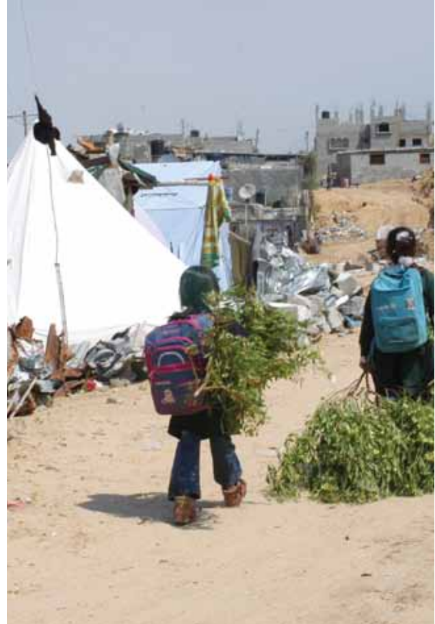
Two school-girls carrying branches for shelter through a neighbourhood in Gaza that saw much destruction during Operation Cast Lead.

Provision is made to replace NFI stocks drawn down as a result of Operation Cast Lead and to ensure that UNRWA has pre-positioned supplies in place in case of future emergencies. The range of items required includes mattresses, blankets, kitchen and family hygiene kits and water tanks. In line with scenarios developed as part of inter-agency contingency planning processes in Gaza, UNRWA is seeking NFI supplies for up to 50,000 persons.