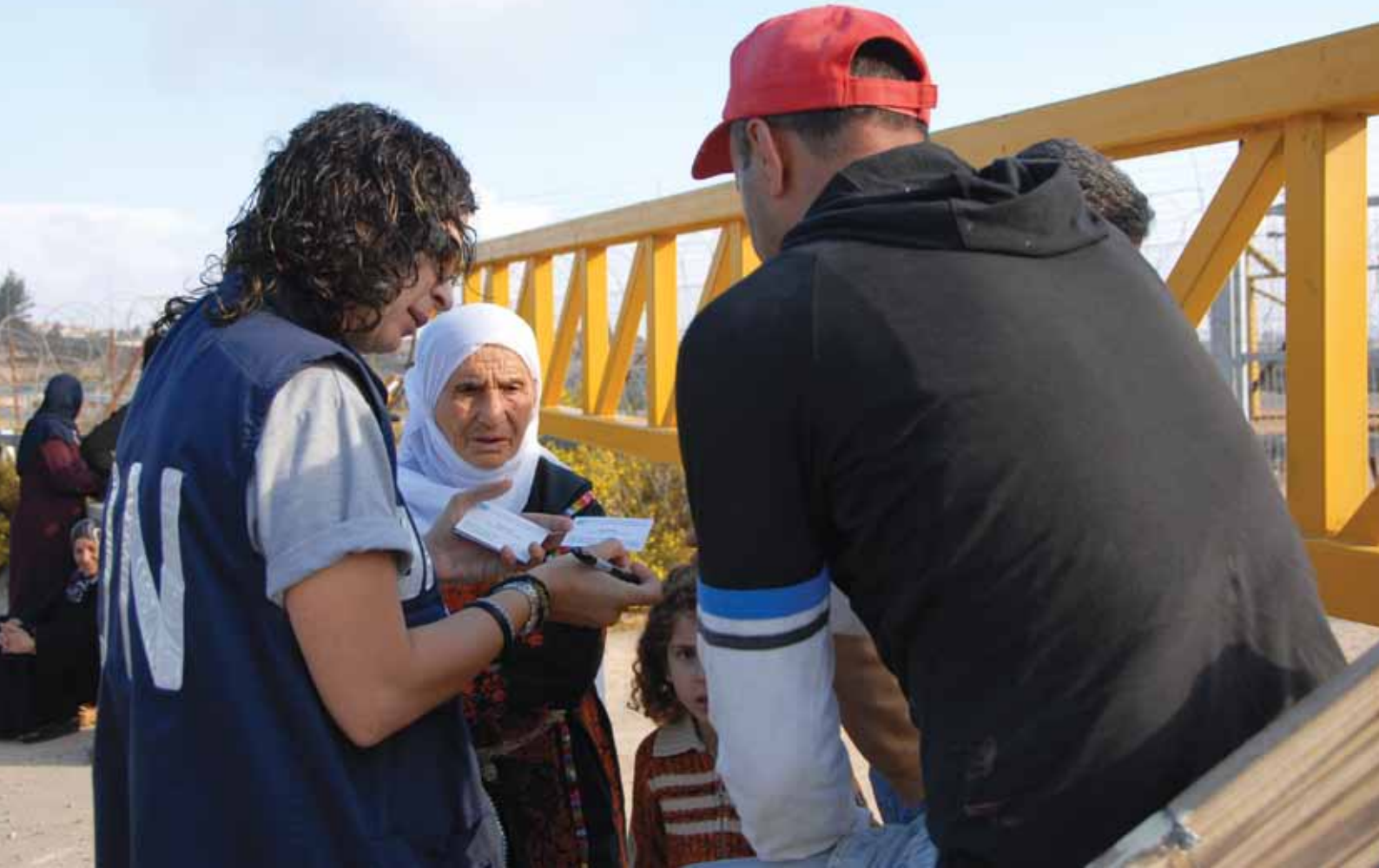
An Operations Support Officer assisting refugees pass through an agricultural Barrier-gate in Biddu, West Bank.

already exists within the OSO programme in the West Bank field.