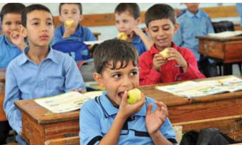
Boys in an UNRWA school in Gaza enjoying apples distributed through the school feeding programme.