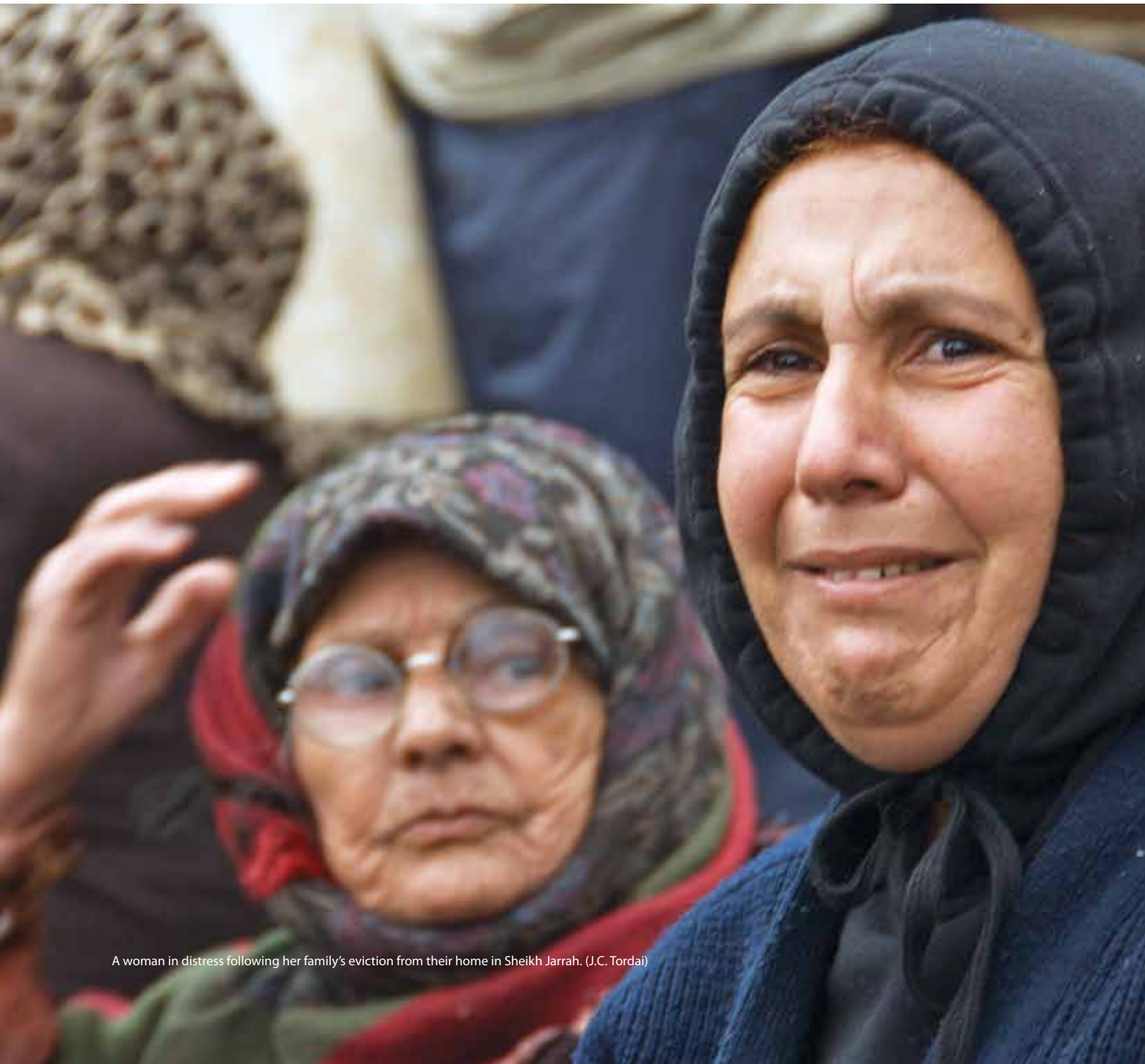
A woman in distress following her family's eviction from their home in Sheikh Jarrah.