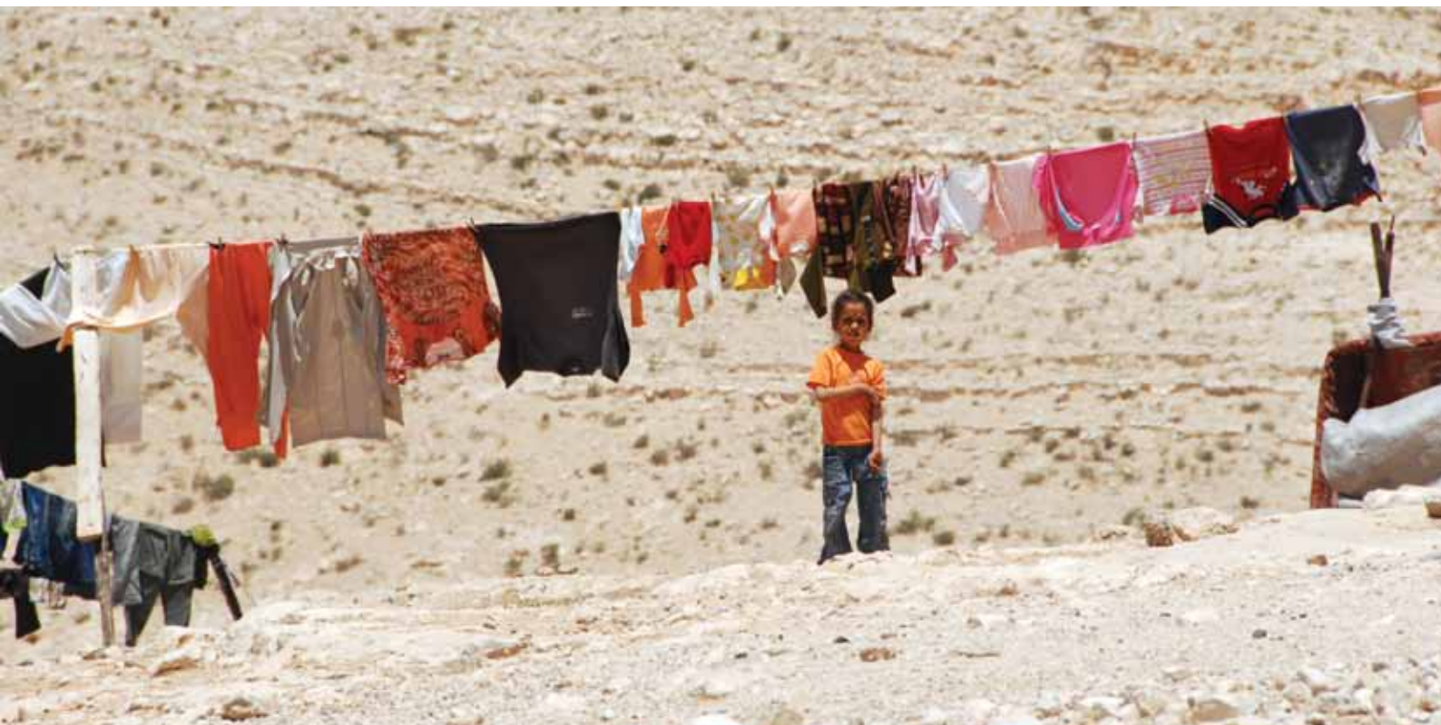
Palestinian girl of the Hathaleen herding community playing near her house in the semi-arid desert of the south-eastern West Bank.

in Area C and East Jerusalem residents and improved access to services for refugees living in monitored Barrier communities, through advocacy and outreach. Provision of emergency cash assistance will ensure that the immediate humanitarian needs of refugees facing home demolition, forced eviction or suffering property damage are addressed.