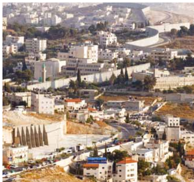
The Barrier going through Abu Dis

UNRWA seeks to further strengthen its capacity for coordination, management and planning of emergency operations, by investing in dedicated resources at field and HQ levels and improving of programme planning tools and systems, in accordance with approaches being introduced as part of the Agency's Organisational Development plan.