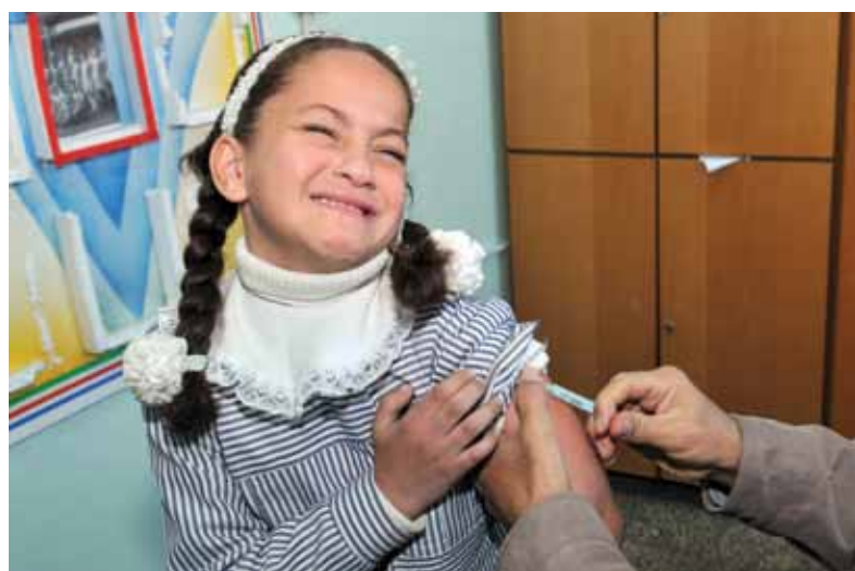
Young Palestinian student receiving a vaccination in an UNRWA school in Gaza as part of the school health programme.

The results of a recent pilot project involving failing students at UNRWA schools suggest a correlation between health and school performance. A number of underperforming students were found to be suffering from anaemia and urinary tract infections and other health conditions that could easily be treated with proper medical care. UNRWA is thus seeking funds to expand its school health programme in Gaza to offer a more in-depth medical screening and follow-up of UNRWA pupils identified as most at risk. Specialized teams of paediatricians, optometrists, ophthalmologists and medical support staff will be based at UNRWA clinics in each of the six educational areas and will conduct in-depth medical assessment, screening and follow-up / referral of the lowest achieving pupils. This intervention will focus on approximately 15,000 children during the course of the school year.