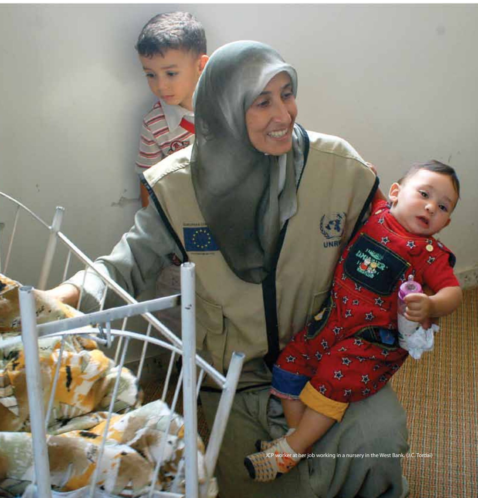
JCP worker at her job working in a nursery in the West Bank.

A caseload of around 300,000 vulnerable refugees has been identified in the West Bank, including those below the abject poverty line or at risk of falling into abject poverty. UNRWA will provide temporary employment to 40,000 families (230,000 persons), to enable them to meet their immediate basic needs and protect their livelihoods. Food assistance will be distributed to 11,200 families, with priority given to those unable to benefit from the JCP due to the absence of a breadwinner. UNRWA plans to provide cash to around 4,000 poor families without a breadwinner.